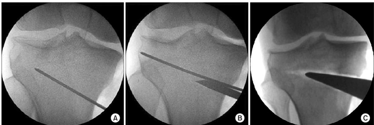
Figure 1: OWHTO. (A) Guide wire is placed (B) Osteotomy is done with a saw. (C) The medial tibia is released with a wedge.

The study protocols were approved by the Ethical Review Board (ERB) of the hospital and informed consent was taken from all the participants. The procedure was performed through a standardized technique by the senior surgeon under tourniquet control. The surgery was performed in supine position under image intensifier through 5 cm incision. Pre operative antibiotics were given to all the patients and tourniquet was used. Two guide wires were placed 3.5-4 cm below the medial joint line passed diagonally 1 cm underneath the lateral margin of the tibia (Fig. 1A). The appropriate location was confirmed with fluoroscope. A tibial osteotomy was then completed directly underneath the guide wires with the help of a saw (Fig. 1B). Afterward, a regulated wedge was introduced till the osteotomy was opened to the preferred extent (Fig. 1C). Once the anticipated degree of correction was attained, internal fixation was performed with a metal plate.