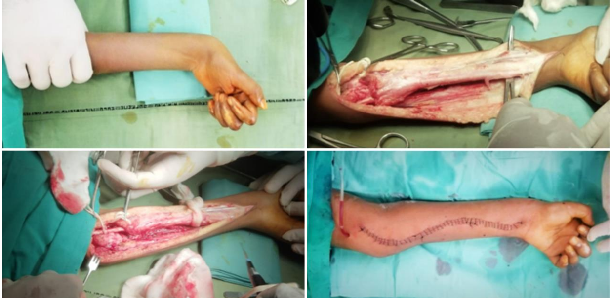
Fig I: Pre-op and Per-op pictures of Max-Page sliding operation.

a qualified physiotherapist and utilizing dynamic splints. In each visit the operated limb was assessed for sensation, dexterity and grip power and graded with Sharma and Swamy grading system as good, fair and poor.