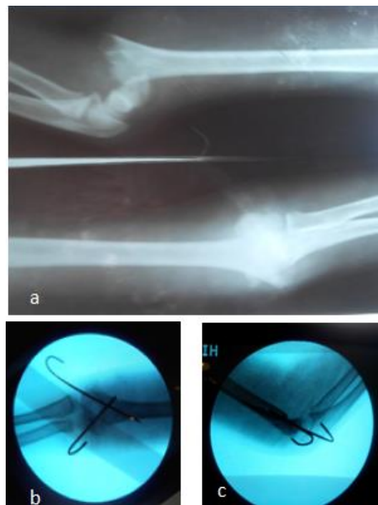
Fig. 2: a) Gartland grade-III supracondylar fracture A-P and lateral view. b) Close reduction and cross K-wire fixation (A-P view). c) Close reduction and cross K-wire fixation (lateral view).

proximal fragment to engage the cortex of the proximal fragment about 3 cm above the fracture line. Before the insertion of medial pin the elbow was extended and assessed the Bowman's angle and anterior humeral line, if acceptable then medial pin was inserted through the center of the medial epicondyle in a similar manner. The pins should cross each other 1.5–2 cm above the fracture line. In either case, posterolateral or posteromedial displacement, the first wire was inserted from the lateral side. In certain cases another wire was also inserted through the lateral epicondyle in divergent or parallel configuration to increase the stability. Radial pulse was intermittently checked. The ulnar nerve in the ulnar groove was easily avoided. On swelled arm, medial wire was passed by direct vision after exploring the medial epicondyle anteriorly by a small incision. Radial pulse reassessed and final reduction and pin placement was checked by both A-P and lateral view image under image intensifier (Fig: 2). The pins were cut off and clinical assessment was done by checking the amount of flexion possible and by measuring the carrying angle of the forearm. Aseptic dressing and above elbow back slab was applied.