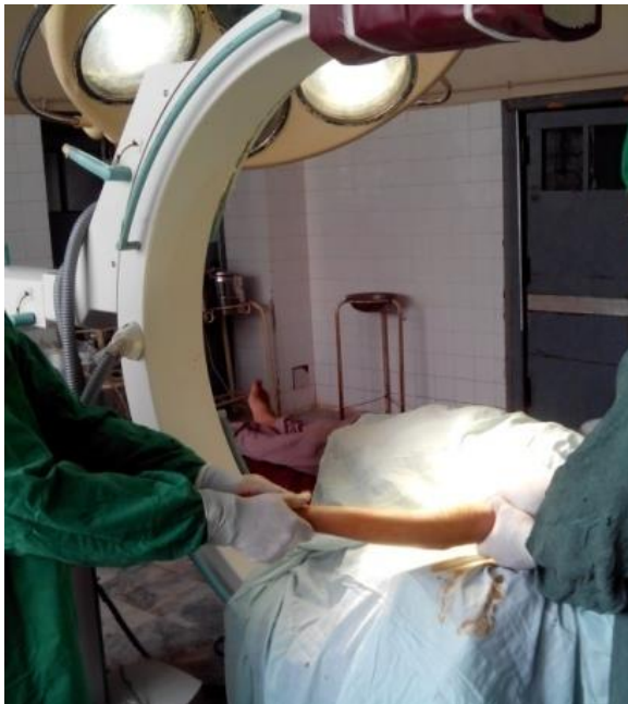
Fig 1: Reduction by traction in extension under general anaesthesia.

Under general anaesthesia and aseptic measures longitudinal traction was applied with elbow in extension and forearm in supination with an assistant applying counter traction to disimpact the fracture (Fig:1). All procedure was assessed under image intensifier. Medial or lateral displacement was corrected by applying a varus or valgus force then angulation was corrected by flexing the elbow with continued traction. Position of the arm was in maximum external rotation on the fluoroscopy platform in case of posteromedial displacement while in the posterolateral displacement the arm was in maximum internal rotation.